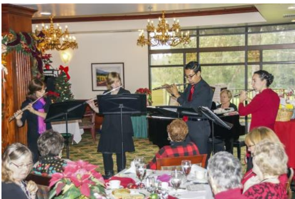
The American River College Flute Quartet Performing At the Holiday Luncheon