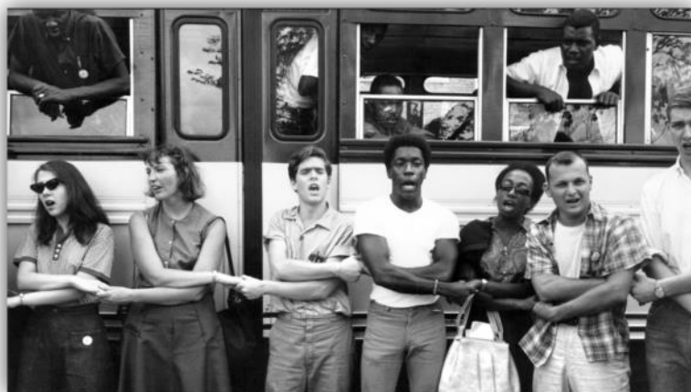
Mississippi Freedom Riders

https://www.eventbrite.com/e/aauw-sacramento-wow-presents-mississippi-then-now-tickets-13592652991