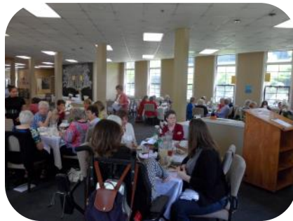
Members socializing before the talk