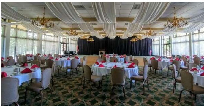
North Ridge Country Club , 7600 Madison Ave. Fair Oaks